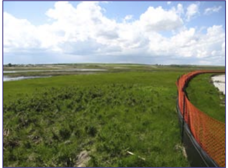
As required, the erosion control silt fences and boundary fence were well established prior to the initial stripping and rough grading of the developable land areas.

After some initial push back to the draft NCWWMP guidelines by the development industry, it is commendable how developers such as Vesta Properties are moving forward incorporating the recommendations in their current developments. It is also inspiring to observe the implementation of the Nose Creek Partnership's suggested setbacks and installation of proper silt fencing. We look forward to seeing the final results of these construction protective measures with minimal disturbance to Nose Creek.